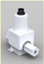
The CR-288 concentration sensor features materials and design compatible with ultrahigh purity and caustic chemicals.